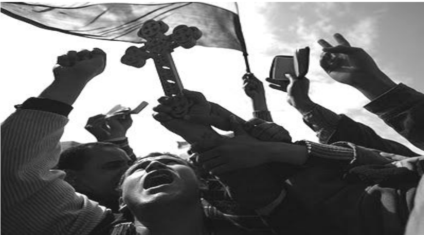
The Cross and the Koran in Tahrir Square (with thanks to The Guardian )

Last Sunday, Muslims and Christians had a memorial prayer in remembrance of the deceased. For the first time in the history of Egypt, the cross was held high in Tahrir Square, hymns were sung and supplications made to the Merciful God to save Egypt with a loud AMEN from all the audience.”