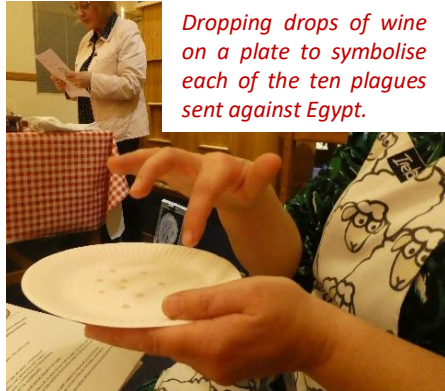
Dropping drops of wine on a plate to symbolise each of the ten plagues sent against Egypt.

The lady who took the leader's role had lived in Jerusalem for six years and had celebrated the Haggadah many times. She explained the rituals as we went along. They included candle lighting; the reasons why we celebrate; the cup of sanctification; hand and foot washing; reading of the first Exodus; the cup of deliverance and answers to four questions children enquire about concerning unleavened bread, eating only bitter herbs, amongst other things. Now that was an interesting sharing meal.