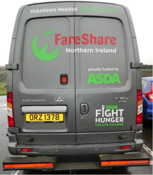
A driver of a van parked next to our car in Ireland and we thought it was interesting for you to see.