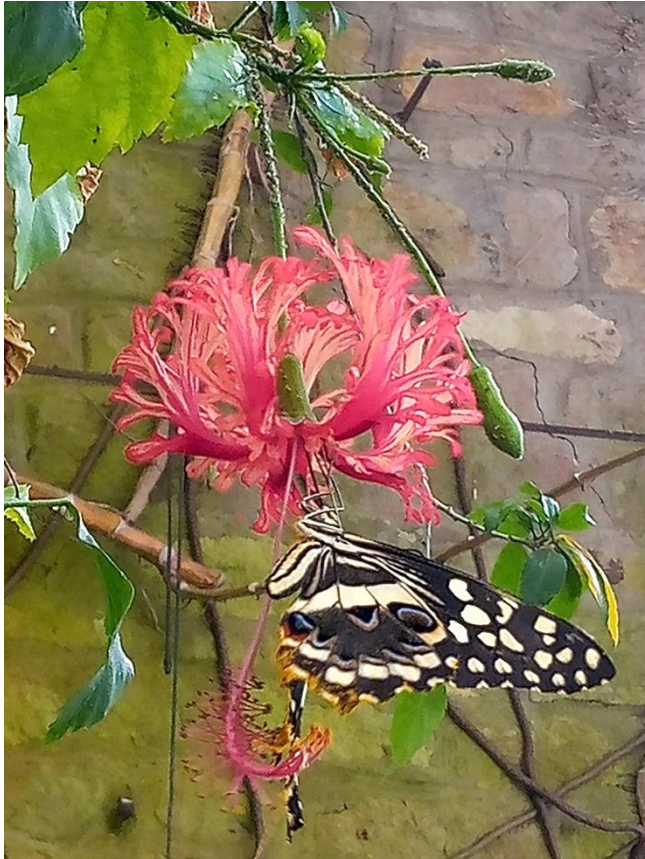
at the Butterfly House next to the Aston Memorial in Lancaster.