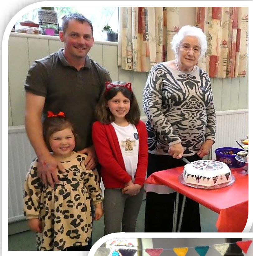
Cutting the coronation cake.