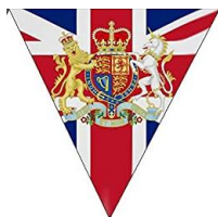
What a Union Jack Hat!