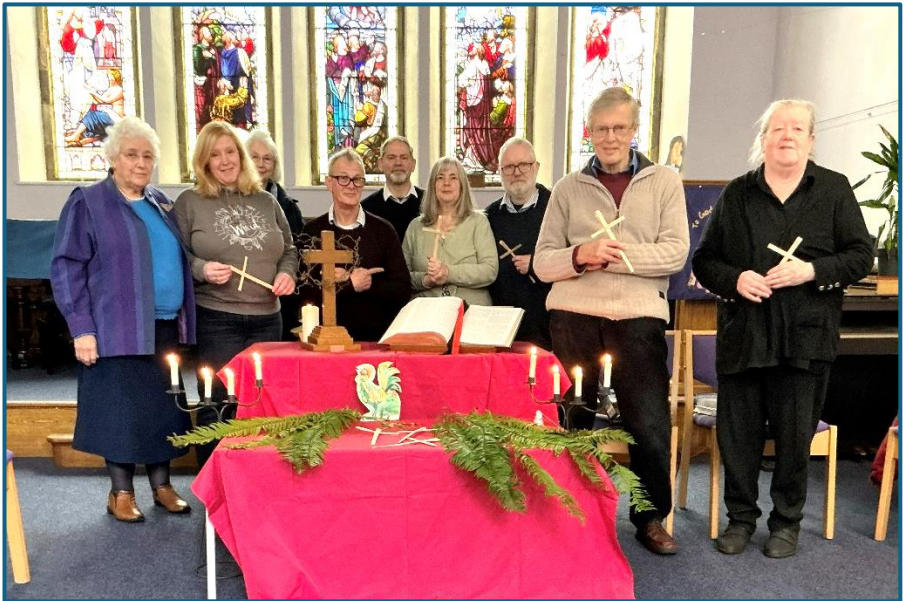
Palm Sunday 29 th March 2026