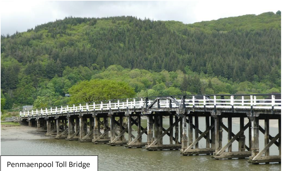
Penmaenpool Toll Bridge