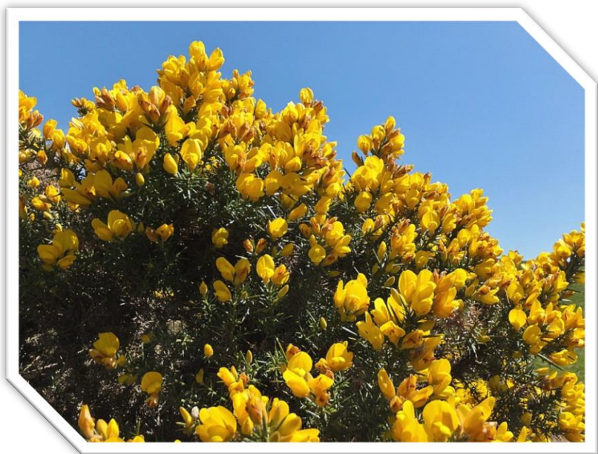
Glorious gorse