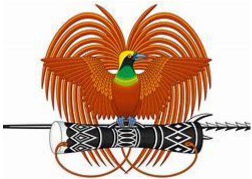
National Emblem of PNG

It was a double celebration given that PNG marks 50 years of independence this year.