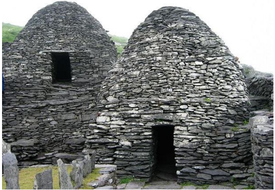
Beehive hut from Skellig.

Slow me down, Lord, And inspire me to send my roots deep Into the soil of life's enduring values That I may grow toward the stars Of my greater destiny.