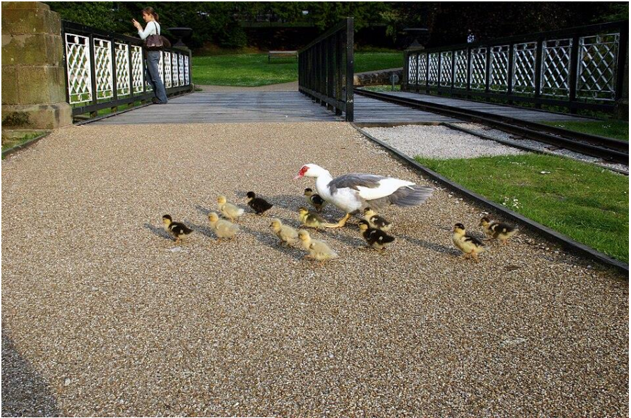
Pavilion Gardens, Buxton.